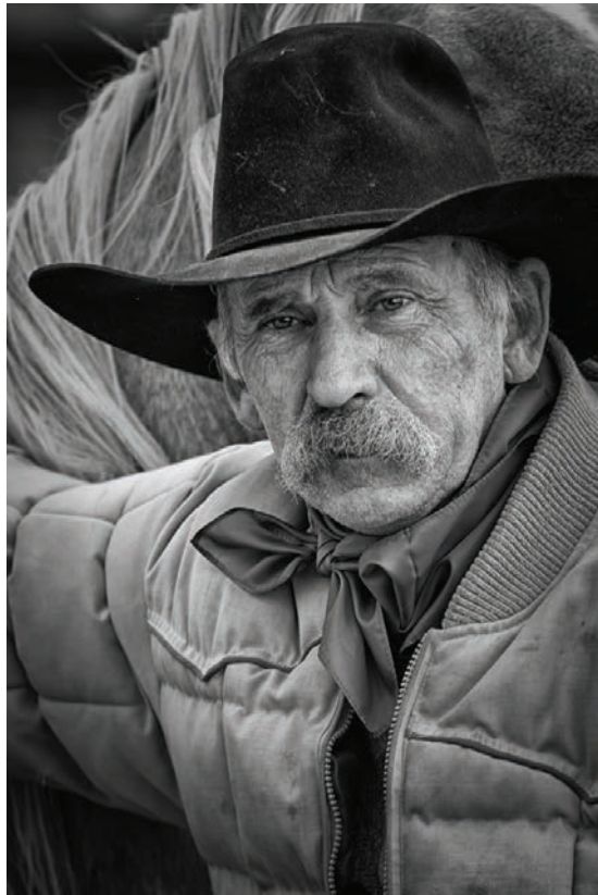
B&W Print Previously Entered "Mark"