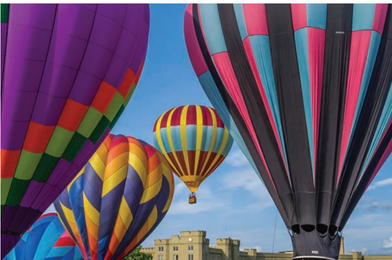
Digital Color Previously Entered "Away They Go" Mitch Keller