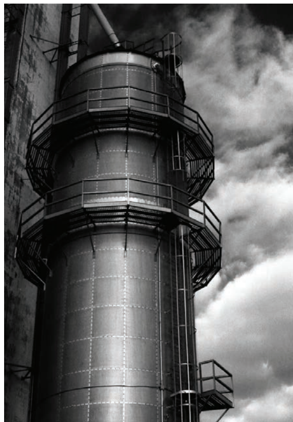
Digital B&W Open Class "Steel and Clouds" Paula Warp