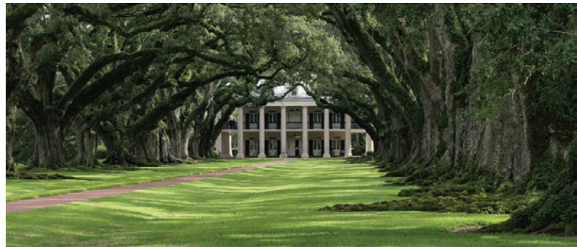
Color Print Open Class